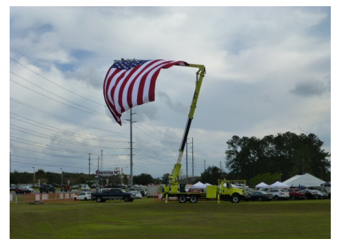
Awesome Display of Patriotism