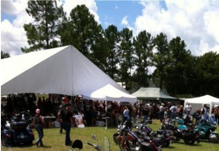
The crowd starts gathering early at the 2016 Ocala Bike Fest.