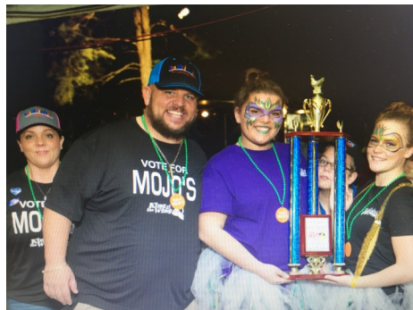
Mojo's Team with their Trophy

Thanks to everyone who participated and we can't wait to taste your creations at next years competition!